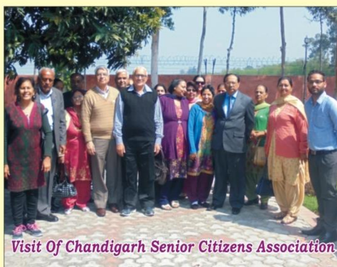
Visit Of Chandigarh Senior Citizens Association